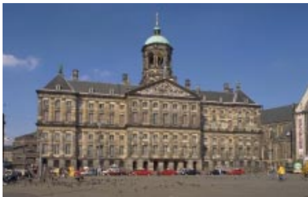
Figure 1. The “Real” Dam Square

This application uses images of paintings on display in the Rijksmuseum, Amsterdam. These images come from the Rijksmuseum Amsterdam Website [6]. Three of these images are shown in Figure 3. The circumstances under