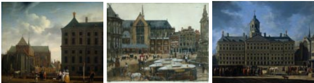
Figure 3. Three Rijksmuseum Paintings of Dam Square