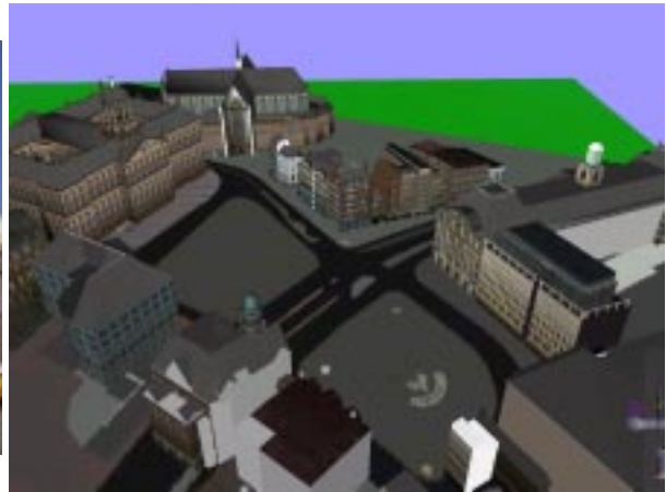
Figure 2. The Dam VRML World (adapted from [1])