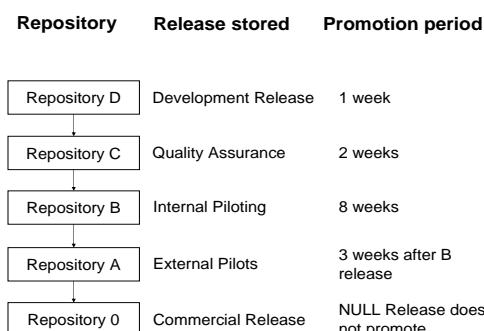
Figure 2: Repository Promotion Scheme and Promotion Periods

The SCM system consists of five repositories, in which five concurrent releases of all deliverables and corresponding source code are stored, as shown in Figure 2. The first repository is the D(evelopment) repository. Each of the five repositories contains a release of all the source files, help files, binary files, executables, resources, and SQL scripts, for one product, such as e-Synergy or Globe. Periodically, depending on the quality criteria for each repository, the full repository is manually promoted (copied) from one repository to another.