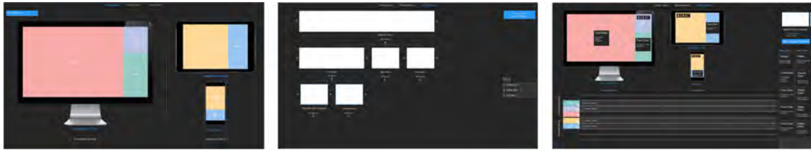
Figure 2. Pre-production workflow (from left to right): layout design, chapter creation, timeline editing

application is the part of the system that a production team would use to create these experiences. The authoring application is a browser-based application, with which a producer can assemble an experience in a step-by-step fashion. Roughly speaking, this process is comprised of designing the layout , creating masters , defining chapters and designing the timeline (see Figure 2). In the layout design phase, the user can either load a predefined layout, e.g. from a previously created experience, or add screens manually and segment them into regions using the mouse. The master creation is concerned with the creation of so-called masters . This is akin to the concept of master-slides in a presentation program like PowerPoint. So for instance, if the user wants certain objects to be shown all throughout the experience, like for instance the broadcaster logo and the lap-counter during a motorcycle race, they would create a master layout containing DMap Components rendering these objects. This avoids the need to redefine these components for every chapter of the presentation. The utility of this approach will become apparent in the next paragraph.