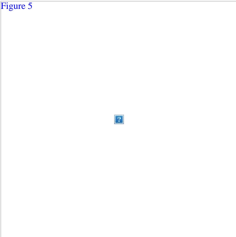
Fig 5: Visualization of museum tours in the Tour Wizard