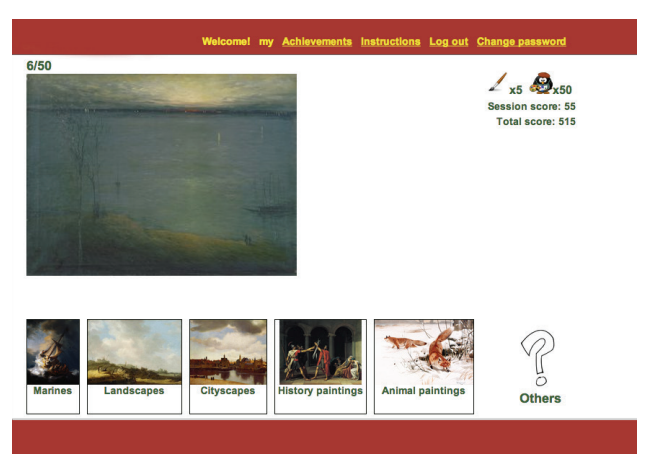
Figure 2: Interface of the art game with the large query image on the upper left. The five candidate subject types are shown below, together with the others candidate.

On the start page, users are given instructions on how to perform the annotation task (if needed, they can go back to the instructions at any point in the game). Users are asked to be as specific as possible in their judgements. This means, that when they can choose between a general subject type (e.g. figures ), and a specific subject type (e.g. half figures ), they should select the more specific one.