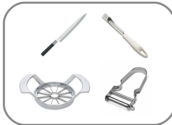
Domain Specific Languages