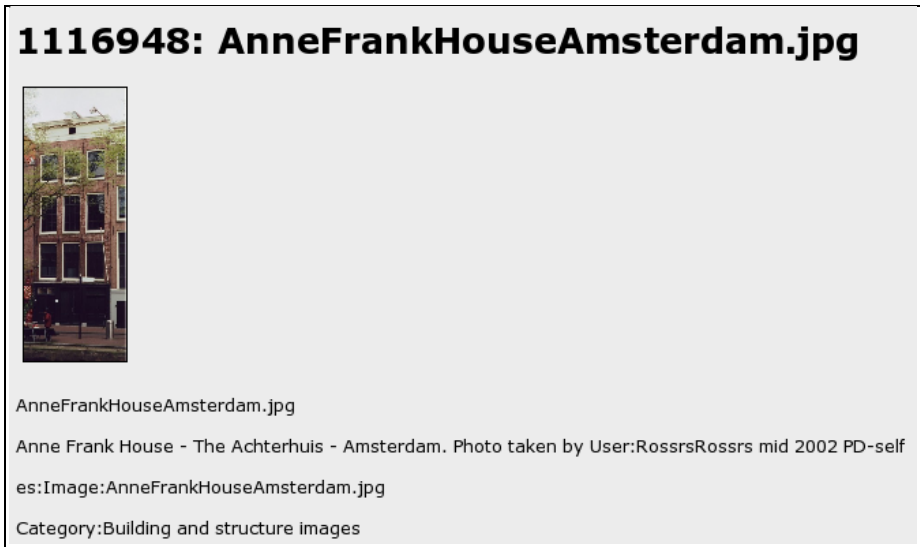
Fig. 1. Example Wikipedia image+metadata from the (INEX MM) wikipedia image collection

These resources had also been provided in the INEX 2006-2007 Multimedia track. The latter two resources are beneficial to researchers who wish to exploit visual evidence without performing image analysis.