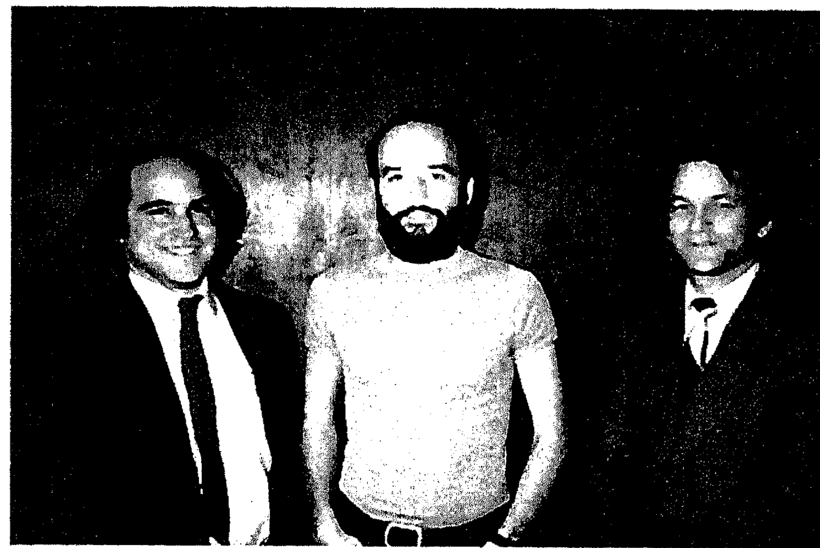
Figure 2. The inventors of the RSA cryptographic method. From left to right: R.L. Rivest, A. Shamir, L. Adleman.

Commercially, the most widely-used cryptosystem is the Data Encryption Standard (DES). This is a symmetric algorithm and is unsuited for public-key use, but has the advantage that it does not rely on time-consuming modular arithmetic. As hardware support for these operations becomes more widely available and inexpensive, however, this is becoming less of a consideration.