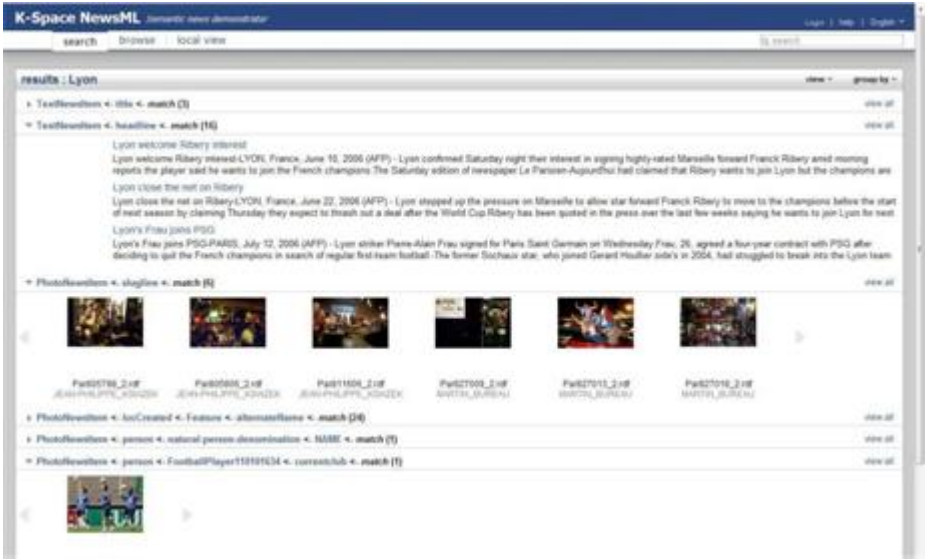
Fig. 4. Search for “Lyon” in the semantic search engine

entity recognized by SPROUT as a location, later on linked with Geonames. The Geonames resource contains information about all the alternative names of Germany in all languages, Saksamaa being the Ethiopian name of Germany.