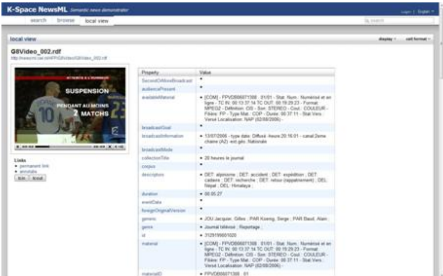
Fig. 6. Video local view: arbitrary temporal segment can be played