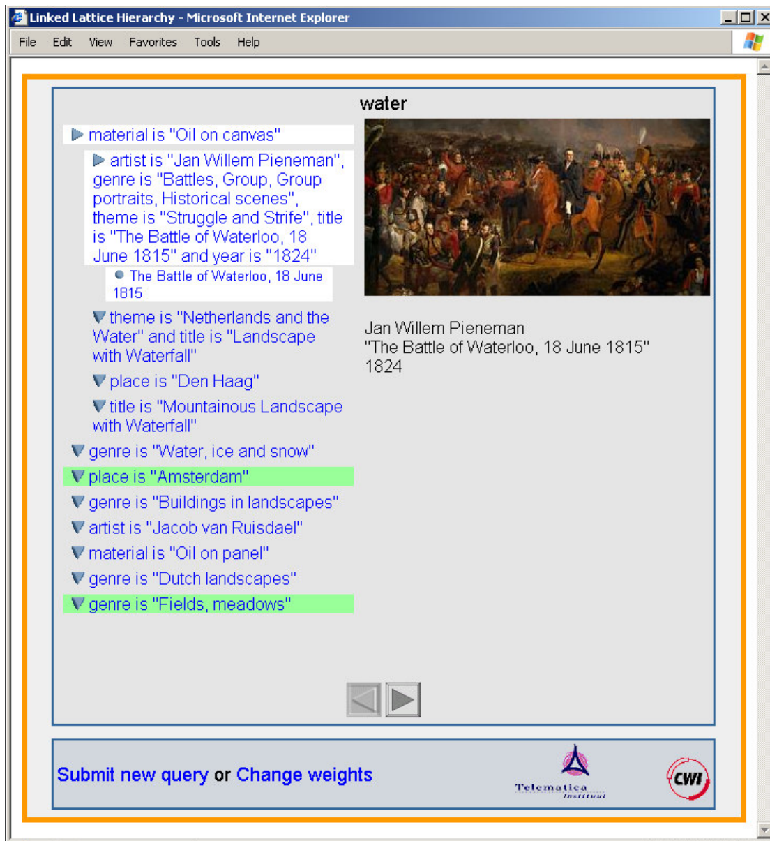
Figure 4. Presentation generated by the Topia demo

Sections 4 and 5 focus on automated generation of sequence and emphasis respectively from universal aspects of semantic annotations. The sections also describe the support that web standards offer.