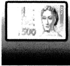
Figure 1. Example of an MRML extension. The user has requested a banknote (marked white) with a background different from the one presented (marked black).

<cui-prolog-query result-container="ResultList" cui-relative-weight="0.1"> <![CDATA[ findall(Image,contains(banknote,Image),ResultList). ]]> </cui-prolog-query> <user-relevance-list cui-relative-weight="0.9"> <user-relevance-element image-location="http://viper.unige.ch/banknote.jpg" user-relevance="1"/> </user-relevance-list> </query-step> </mrml>